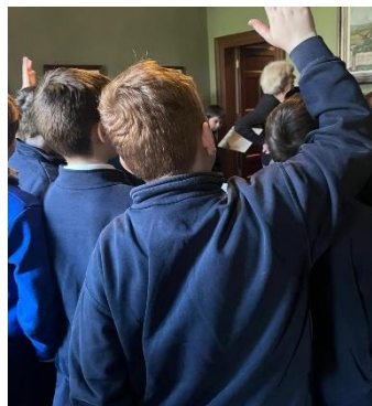
4 th class visiting St Enda's park and Pearse Museum